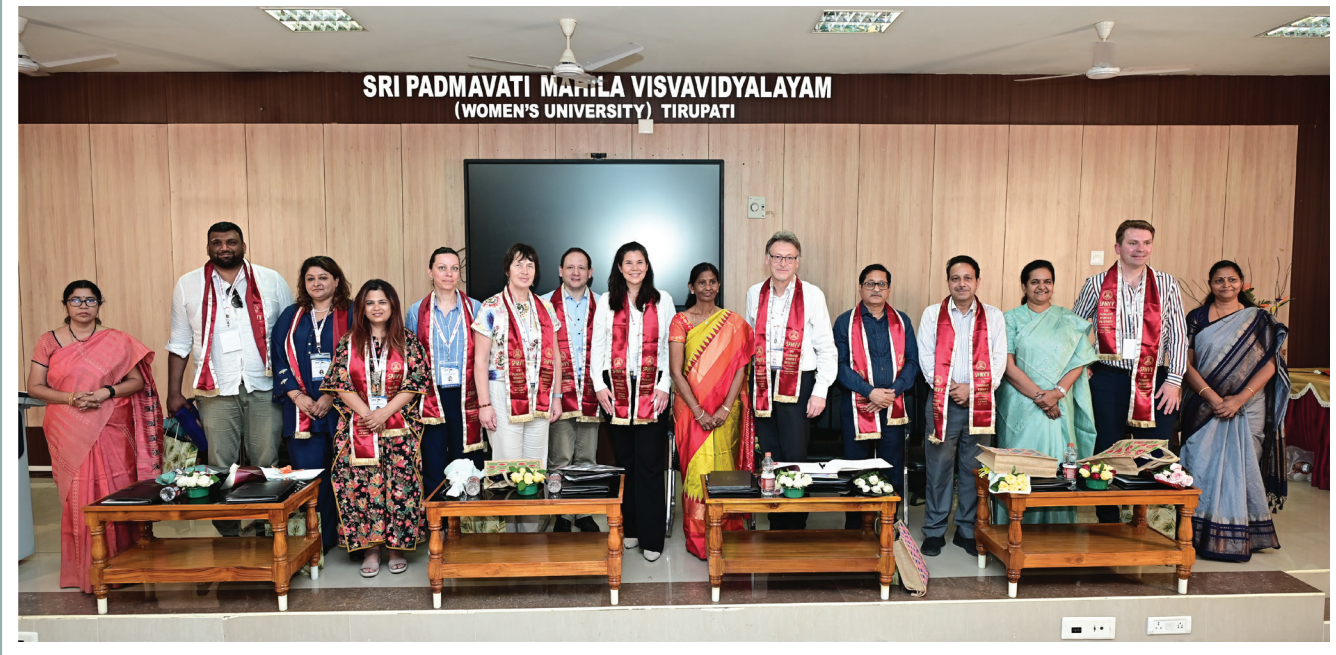
Delegates from Magdeburg University, University of Heidelberg, University of Cologne, Freie University, Germany interacted with SPMVV officials and Faculty under Universities-INDO-German S&T Cooperation Programme.