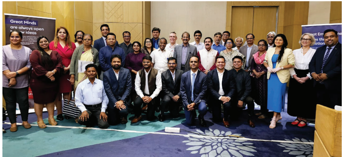
SPMVV Team participated in UK-Andhra Pradesh TNE-Roundtable Meeting Organized by British Deputy High Commission, Hyderabad along with APSCHE at Vijayawada on 27.11.2024.