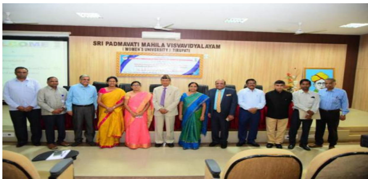
Innovation & Translation on Foods & Feed: The Journey of an Entrepreneur” on 13-03-2019