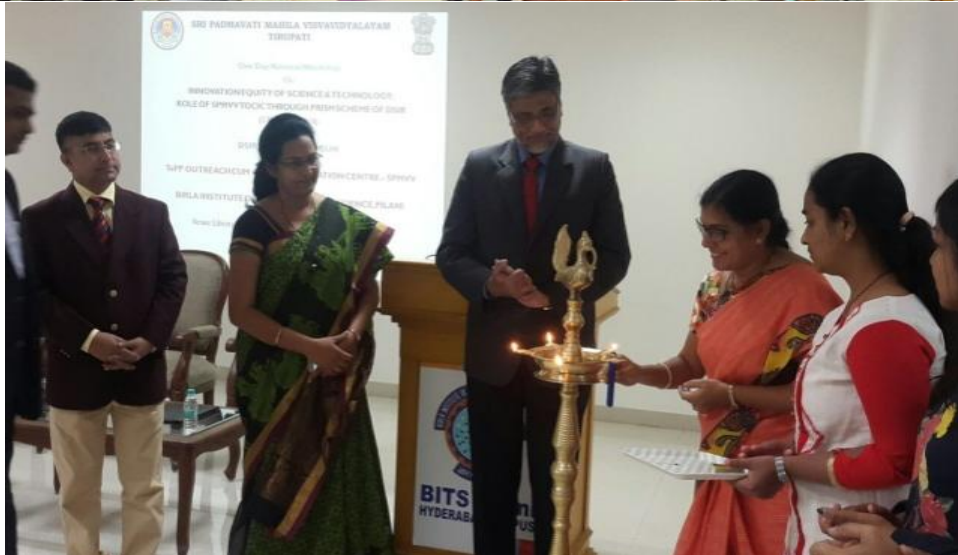
“Innovation Equity of Science & Technology” workshop at BITS Pilani, Hyderabad Campus, Hyderabad