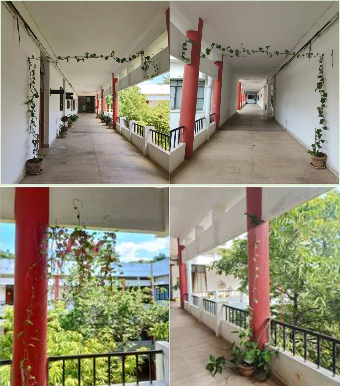
Department of English Corridor