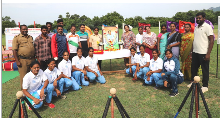
Department of Physical Education on National Sports Day