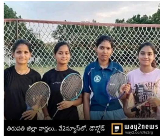
తిరుపతి జిల్లా వార్తలు... వే2న్యూస్.లో. డాన్లడ్ way2news way2.co/c9s3rg

signed by women entrepreneurs, includes a diverse range of handcrafted items: “Pure silk and Kalamkari fabrics sourced from across India” “Intricately designed Kalamkari photo frames” “Flower vases and bouquets crafted from silk cocoons and threads” These distinctive products are created to suit various events and will be available for purchase both online and offline. The founders expressed confidence that Sanvika's commitment to affordability, durability, quality, and uniqueness will attract a broad customer base. “The launch event saw participation from university faculty, staff, and students.