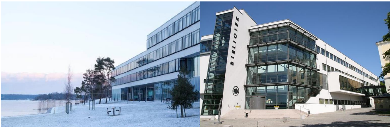
Campus Karlskrona of BTH and Library

*Bachelor Qualification Plan will comprise of agreed curricula, pre-requisite courses, conditions for award of the degree at BTH.